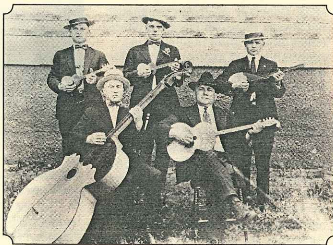
Old Country Band From the Preserving the Old Country: The Experiences of Croatians, Serbians, and Slovenians in St. Louis County Traveling Exhibit

When I began work at the St. Louis County Historical Society over nine years ago I had little true understanding of what a historical society actually did. Quickly I learned that the main areas of its functioning were collections – archival and artifact, exhibits, and programming, also known as “education”. SLCHS since its beginning in 1922 has amassed an impressive artifact collection of over 8,810 exactly catalogued artifacts of all descriptions, as well as many others not yet catalogued because of their size, insufficient